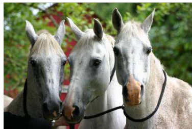
Three of our four horses...

We are about to begin our next major project, the biggest ever for us. We expect to visit numerous capitals from the west coast to the east coast. We are once again taking white horses across America.